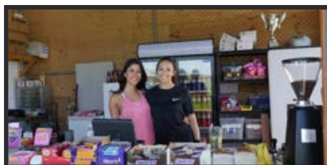
"Canteen in action"