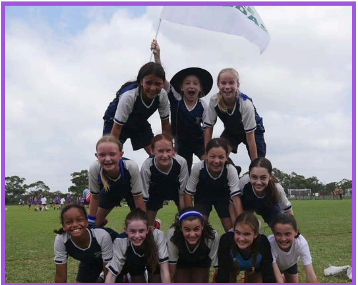
"Skellern Cup Participants"