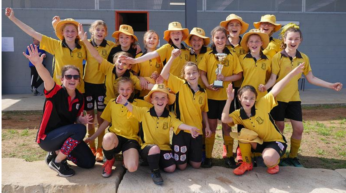
Pymble Public School – Senior Cup winners.

“Each year we want every player to go home with a massive smile on their face after a great day of football with their friends.”