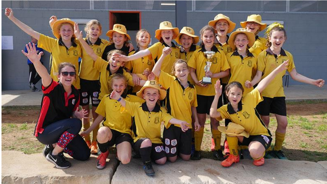
Pymble Public School – Senior Cup winners.

“Each year we want every player to go home with a massive smile on their face after a great day of football with their friends.”