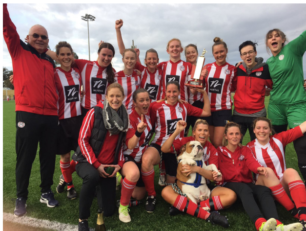
Northbridge A: Four-time WAA1 title winners.

Unfortunately, none of the teams was able to win the State cup, however, G12 Lindfield Kerr reached the Semi-Final and WAA Northbridge A made back-to-back appearances in the Final, going down 4-0 to Albion Park. Northbridge A also secured their fourth consecutive division 1 title, only the second time this has ever been achieved. Mt Colah narrowly won the W35 Div. 1 competition for the second time in a row, narrowly finishing ahead of North Sydney United by 1 point.