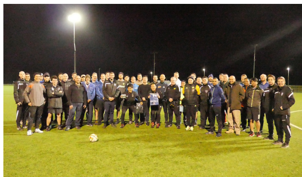
Yokohama F. Marinos coaching workshop

The INSPIRE coach support program expanded its offerings and impact during the 2018 season, providing greater curriculum content through the creation of five session plan curriculums, divided by each development phase. The INSPIRE program exceeded its 2017 membership of 252 members, to 678 in 2018. The INSPIRE coach support program has been created to provide all coaches within NSFA a guide to introduce them to coaching, as well as to support their development as they progress their players and themselves throughout the season.