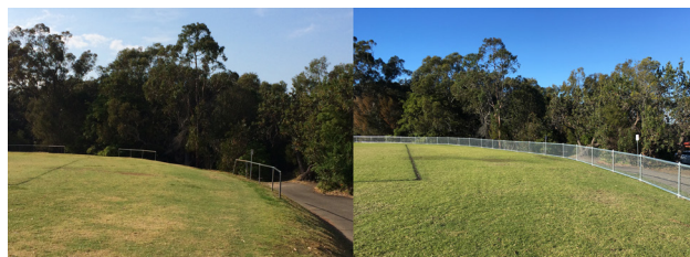
Darnley Oval fence: before and after