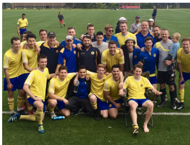
Above: West Pymble Men's Premier League

West Pymble won their fourth successive Premier League title in 2018, finishing 10 points ahead of the newly promoted Northbridge FC. West Pymble also pipped Northbridge in reserve grade on the last day. Season 2019 will be West Pymble's 50 th successive year in the highest division of All Age.