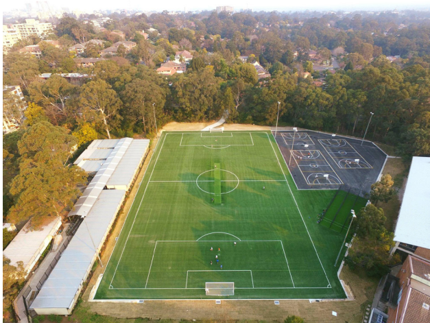
Chatswood High School Synthetic

2018 has been a tremendous year for NSFA and its member clubs, as the standard of facilities continues to improve and the number of these facilities increases. We had particular success with grants awarded for a number of much-needed projects across the association. Another highlight was the full utilisation of the North Turramurra Recreation Area (NTRA) precinct, following completion of the car park almost 12 months ago. The superb utility of this site was exemplified on NSFA Grand Final Day, where all three fields were used for an assemblage of community football. Whilst the synthetic field at Chatswood High School was finished last year, the first NSFA match wasn't played on the ground until the opening day of the 2018 season. The long awaited conversion was a welcome addition for Chatswood Rangers, who grew from 714 to 869 players.