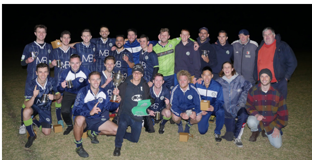
Lindfield: 2018 NSFA Cup Winners

This season was the first played under the new codified tournament regulations. The major changes were maximum squad sizes and a requirement for players to play at least one match in the tournament in order to play in the final. In the NSFA Cup Lindfield won their fifth title when they defeated Northbridge 1-0 with a golden goal. In the Rick Close Cup North Sydney United came from 2-1 down against Northbridge with 10 minutes to go and stormed home to bag the win 3-2 in the final minutes of normal time. This was their third win in a row in this competition.