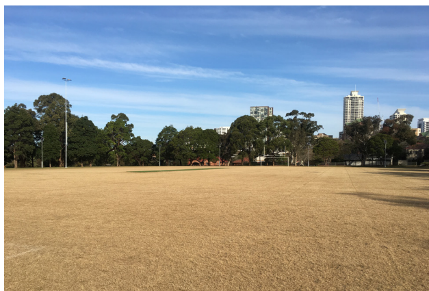
Below: Naremburn Oval

Ku-ring-gai Council: Following the renovation to its playing field, Koola Park also received an upgrade to the amenities building, including new shower cubicles, tiled floors and freshly painted walls. An 18 space car park will be construct-ed adjacent to Koola Road. The same amenity upgrade was executed at Howson Oval but unfortunately, the equivalent upgrades at George Christie and Comenarra were removed from next year's delivery plan. However, works to upgrade the lighting at Primula will commence shortly and for the first time on any sportsground in NSFA, LED globes will be installed. Although more expensive to purchase it is believed they are more cost effective and have a longer life than regular globes. Some minor renovations to the fencing and pathways are also part of the overall project. Council will undertake planning for a Masterplan at Bannockburn Oval, which will include im-proved seating, parking, fencing and upgrades to the playing surface. Progress to convert Warrimoo Oval into a synthetic surface continues.