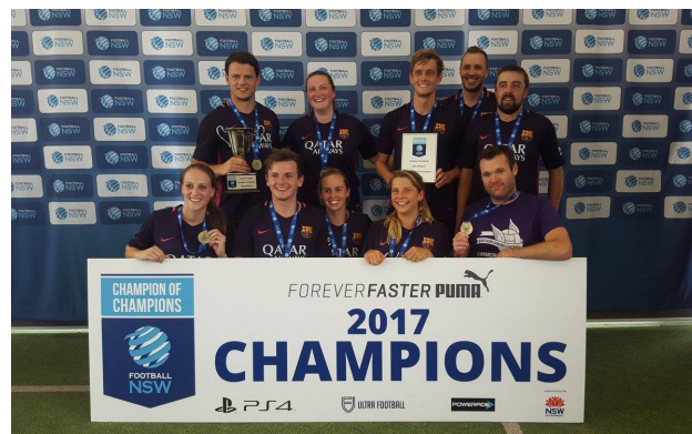
Turra Tigers: Summer Mixed Champion of Champions Winners