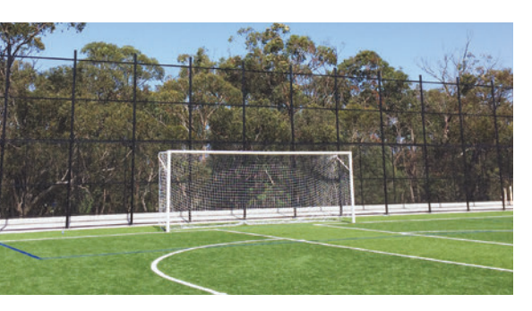
(above): The new fencing at NTRA. (below): Spectator car parking capable of accommodating 200 cars.