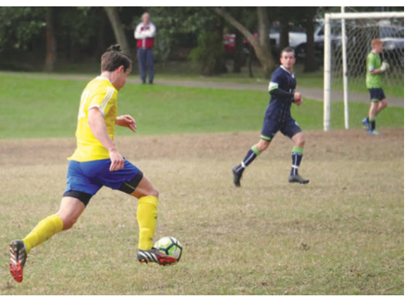
(above): A cross section of games featured in NSFA's website and Facebook pages.

Since commencing work with NSFA in March this year, 2017 has seen massive changes made to how NSFA delivers information to its members, most notably in the form of new websites for the association itself and Northern Tigers FC.