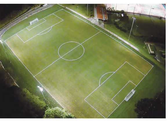
Drone aerial shot of Cammeray Oval.