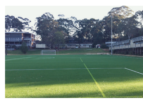
(above): The new synthetic surface at Chatswood High School. (below): New perimeter fence and improved drainage/playing surface at Foxglove Oval.