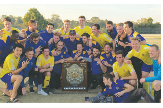
MAA Premier League Premiers West Pymble.