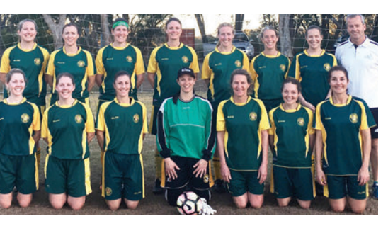
WO35 Division 1 Premiers Mt Colah.