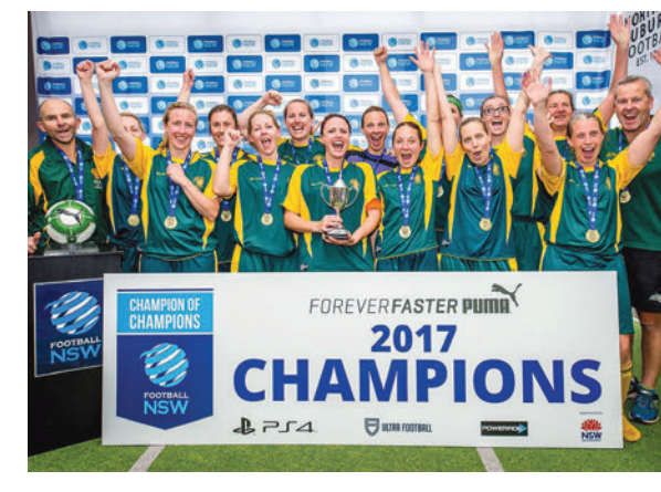
WO35 Champion of Champions Mount Colah.