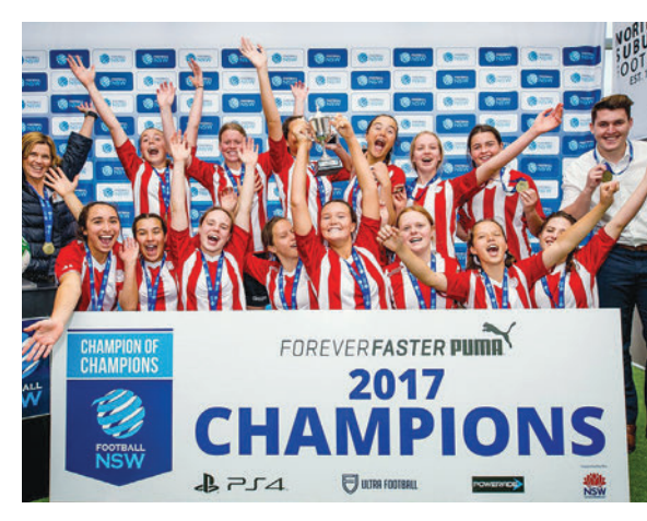
GU16 Champion of Champions Northbridge.