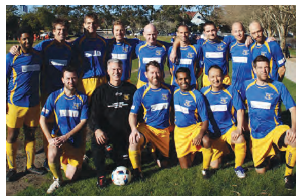
Lane Cove – O35 Div2.