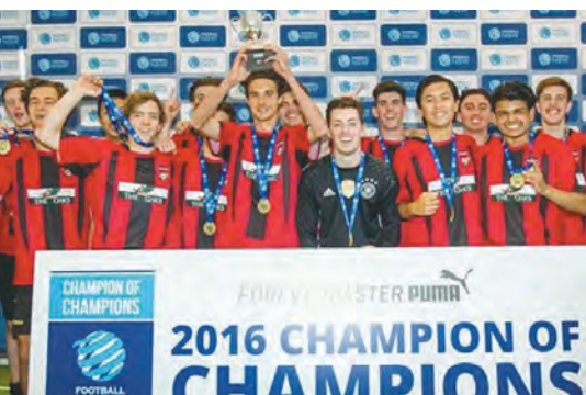
U20 Champions C of C – North Sydney United.