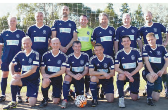
St Michaels O45 1A.