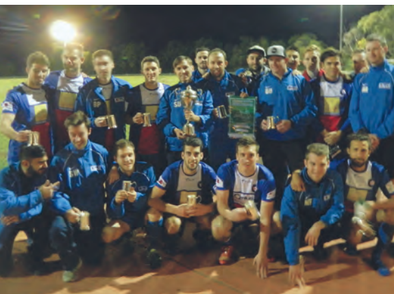
NSFA Cup Winners 2016 – Kissing Point.