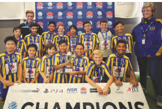
U12 State Cup Champions – Hornsby RSL Youth U12.