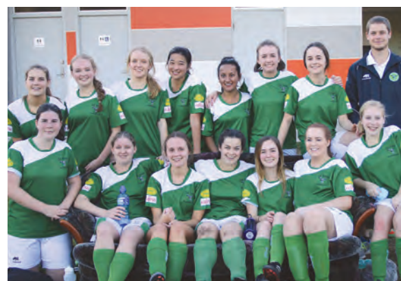
St Ives WAA2.