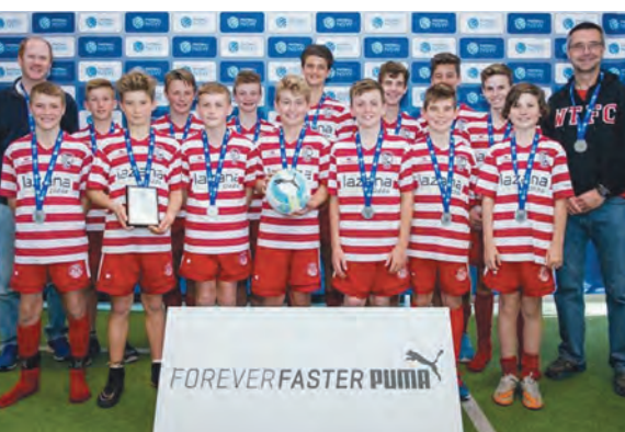
U13 C of C Runners-Up – Wahoonga.