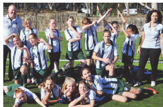
Northern Tigers G12 SAP.