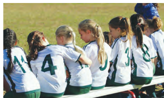
Northern Tigers G10 SAP.