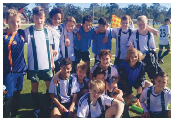
Northern Tigers Boys U13.