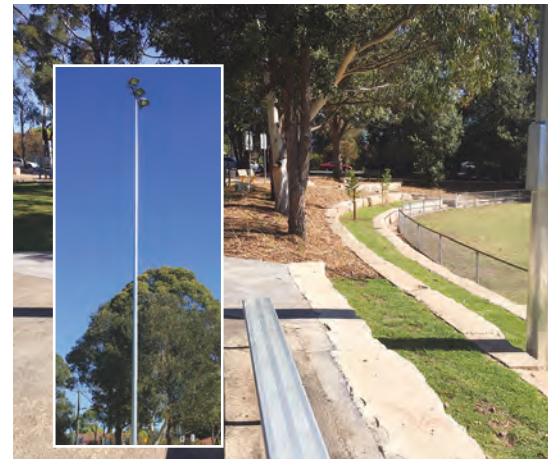
Asquith Oval – Improved lighting (inset), tiered seating, landscaping and new BBQ facilities.