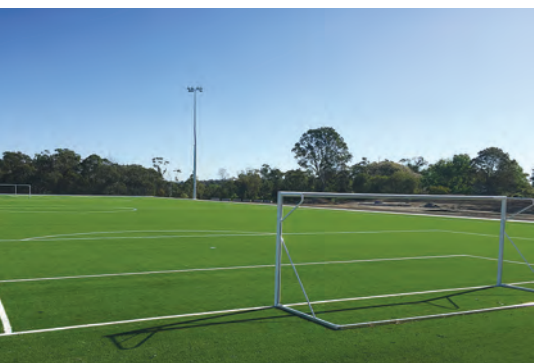
North Turrumurra Recreational Area – 1 full size synthetic field, 2 small synthetic fields plus two full size natural turf fields

Two major projects which are close to completion are Koola Park and North Turrumurra Recreation Area (NTRA) . Crucially, 2017 will see the introduction of 4 NEW fields to NSFA across these two locations. I refer to 3 fields at NTRA and the inclusion of 1 additional field than previously available at Koola Park. Neither of these sites have officially opened but they represent the first new football fields in the Ku-ring-gai LGA in almost 3 decades. To confirm, NTRA consists of 1 full size synthetic field, 2 small synthetic fields (32m x 24m), plus two full size natural turf fields.