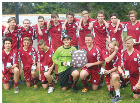
Vice-President Shield Winner Berowra.