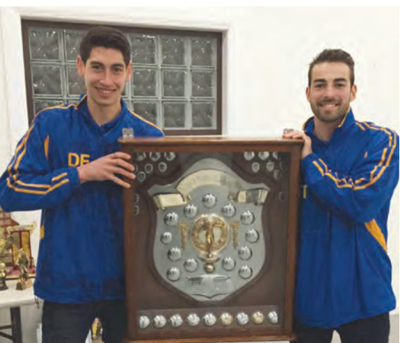
Premiershipe Winners 2016 – West Pymble.