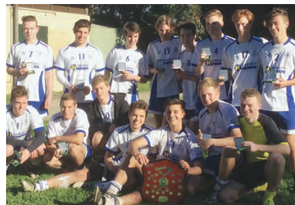
President Shield Winner Asquith.

*Regraded from D3 with full points and ½ GD