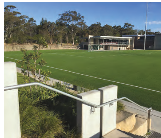
Charles Bean – Now finished with tiered and landscaped surrounds.