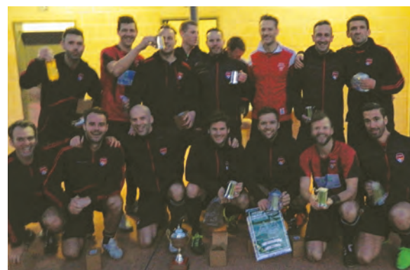
Rick Close Cup 2016 North Sydney United.