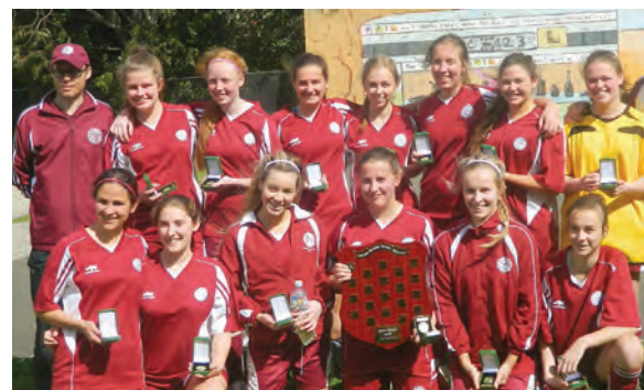
Winners of the GWFC Shield 2016 – Berowra 18A.