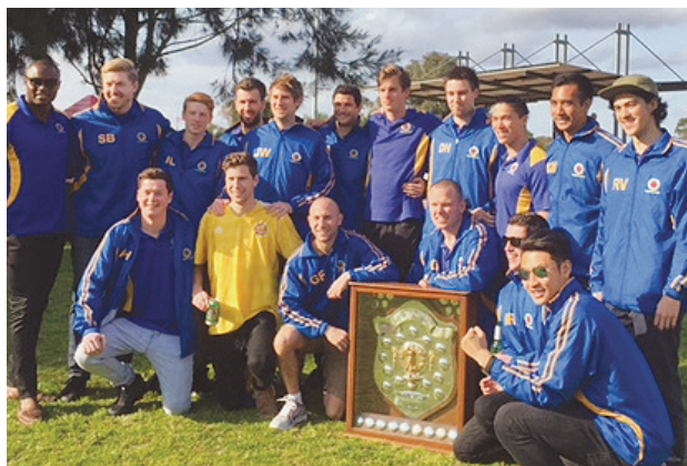
West Pymble FC 2015 Premier League winners.