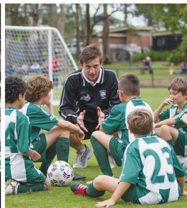
Northern Tigers SAP U9 – Being coached by current U20 Player, C Licence Coach and Northern Tigers Player since Under 12 (ex Wahroonga Tigers).

Across the board the results improved for all teams. Our Women's First Grade and Reserves were competitive achieving greater success than 2015 season. Our U13 to U17 Girls go from strength to strength which bodes well for 2016 season with the majority of players moving up to the next age group. Our Youth teams improved on 2015 results with all teams improving their point's tally and goal difference.