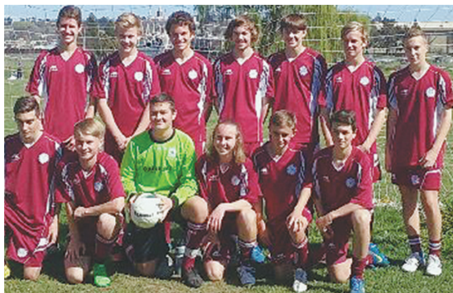
Berowra FC U15's played in Champion of Champion's.