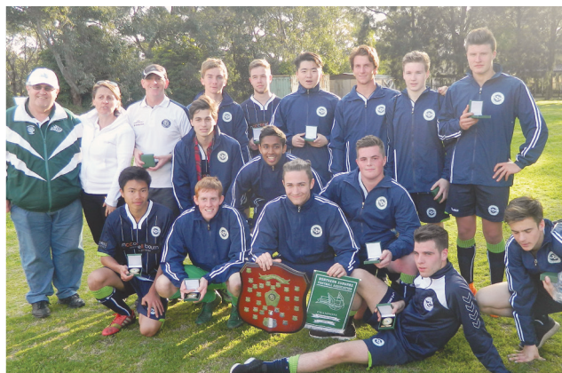
President's Shield winners, Lindfield FC.