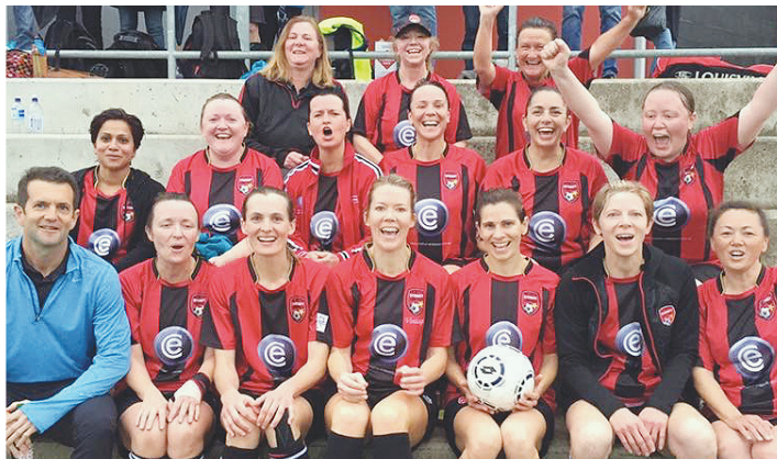
North Sydney United FC, W035 Div 1 winners, who made it to the Semis of Champion of Champions.