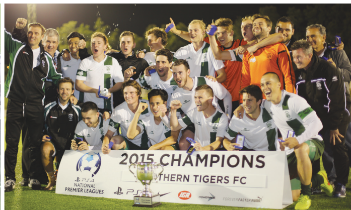
20's First Grade Premiers.

As the Representative arm of Northern Suburbs Football Association the 2015 Season was Northern Tigers most successful season to date, with 10 of the teams reaching the Grand Finals and represented in every Youth age group finals bar 1 and in 3 of the 5 Senior teams. With 5 of the 10 teams reaching the Grand Final and 3 teams being crowned Premiers.