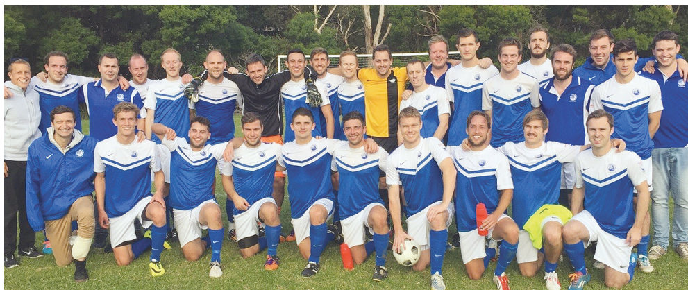
NSFA Cup winners Chatswood Rangers FC.