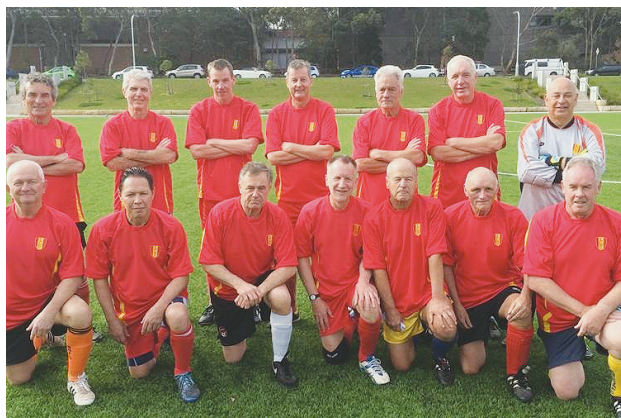
The South Team 060's winners, consisting of players from the south of the Association.