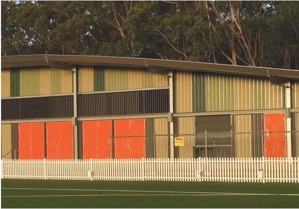
The new facilities nearing completion at Blackman Park.