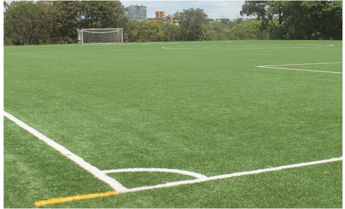
The synthetic playing surface at Cammeray Oval.

Looking ahead – North Sydney Council is currently reviewing a Development Application for installation of synthetic turf at Anderson Park . Should the DA be approved, works could commence as early as March 2016 with the field being available to NSFA the following winter. After many years of promises regarding Koola Oval, Killara, NSFA can confirm that works have commenced on levelling and re-turfing the whole site, installing irrigation and creating an additional playing field. The pavilion will also receive a minor makeover to improve accessibility and internal configuration. At completion football will have access to 2 dedicated fields with a further dual purpose field (football/rugby).