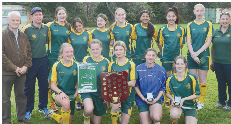
Mt Colah FC GU18A, GWFC Shield winners 2015.