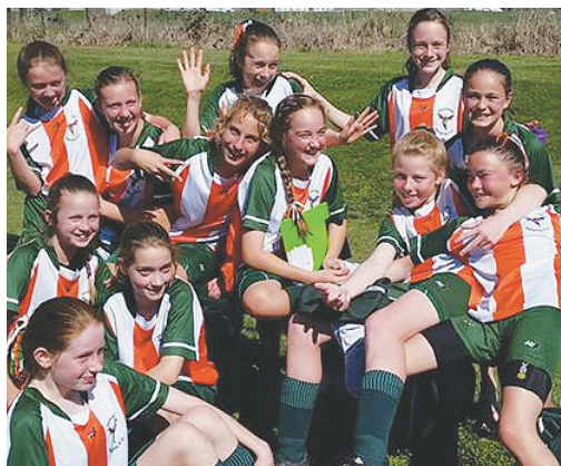
Hornsby Heights FC GU12 Champion of Champions winners.