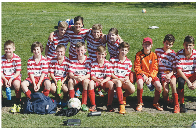
Wairoonga FC U12's played in Champion of Champion's.