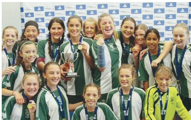
Girls U13 Premiers for 2015.