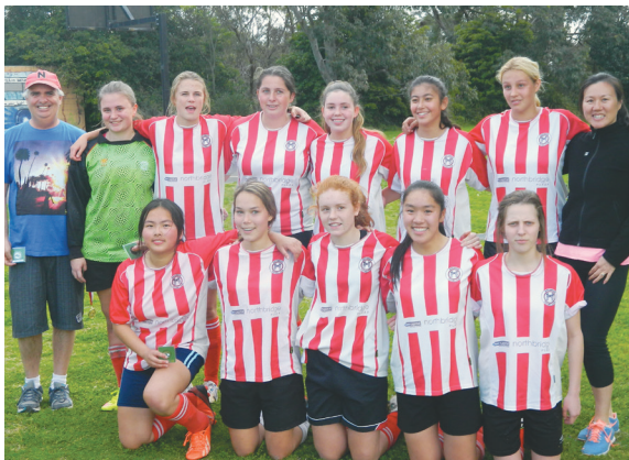
Northbridge FC GU18A, GWFC Shield runner up 2015.