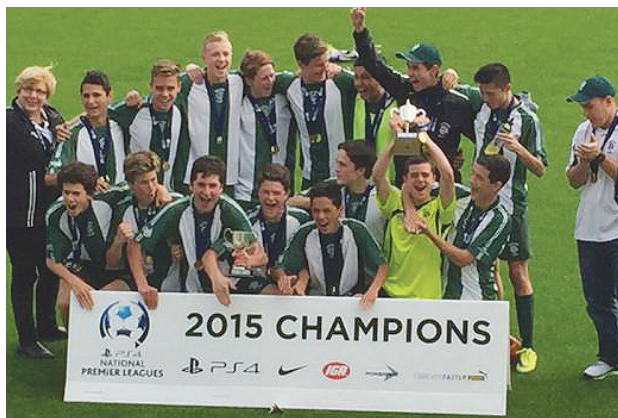
Undefeated Northern Tigers U15's.