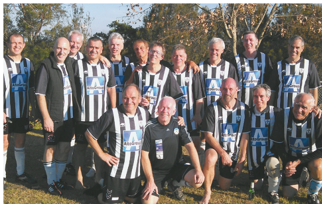
Prouille FC 045-2B team, the 'oldest' in the competition.