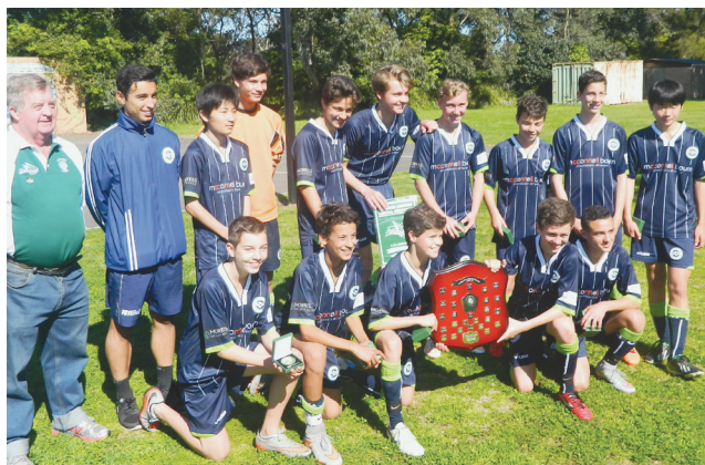
Treasurer's Shield winners, Lindfield FC.