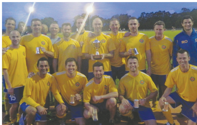
Winners of the Rick Close Cup 2015, West Pymble FC.