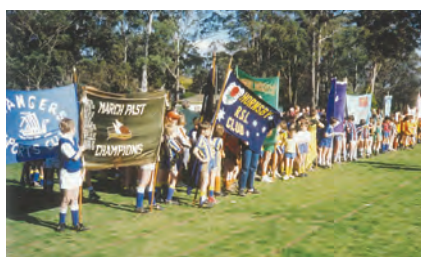
The Gala Day March Past.

In 2013 there were 34 affiliated member clubs in NSFA as well as teams from Gladesville Ravens and NSFA Tigers.