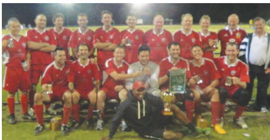
Rick Close Cup 2013 winners – Wahroonga 035's.