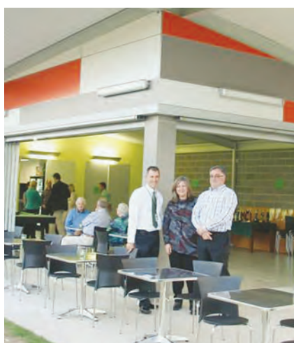
Warrimoo club house opened on the 6 September 2013 by Ku-ring-gai Council.