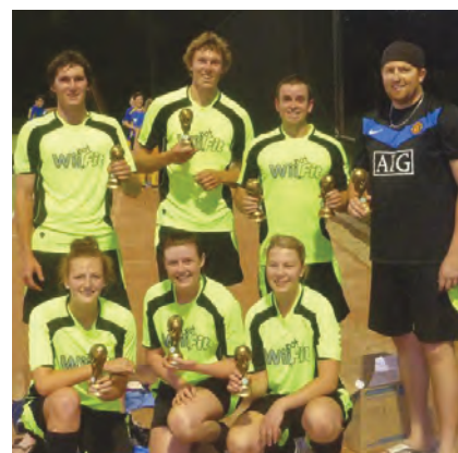
AA Mixed Competition winners Wii Not Fit.