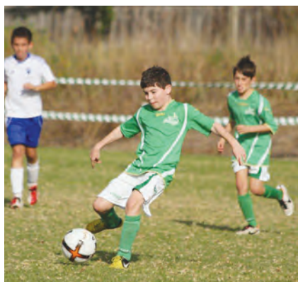
(below): U11 NSFA SAP v Sydney Olympic SAP

Player and coach development initiatives are key elements to growing player registrations in the Association as well as creating “footballers for life” out of existing players. The past year has been another successful one for development as we continue to build on the foundations laid in prior years.