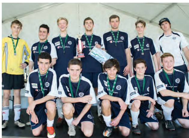
U18 Group 3 Winners, Lindfield B.