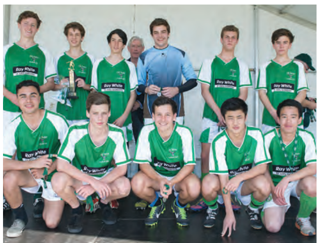
U18 Group 1 Winners, St Ives K.