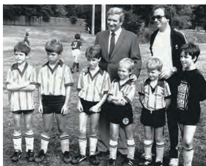
Bannockburn Rovers Soccer Club is one of the Clubs no longer in existence within NSFA, having merged with Clarke Road.