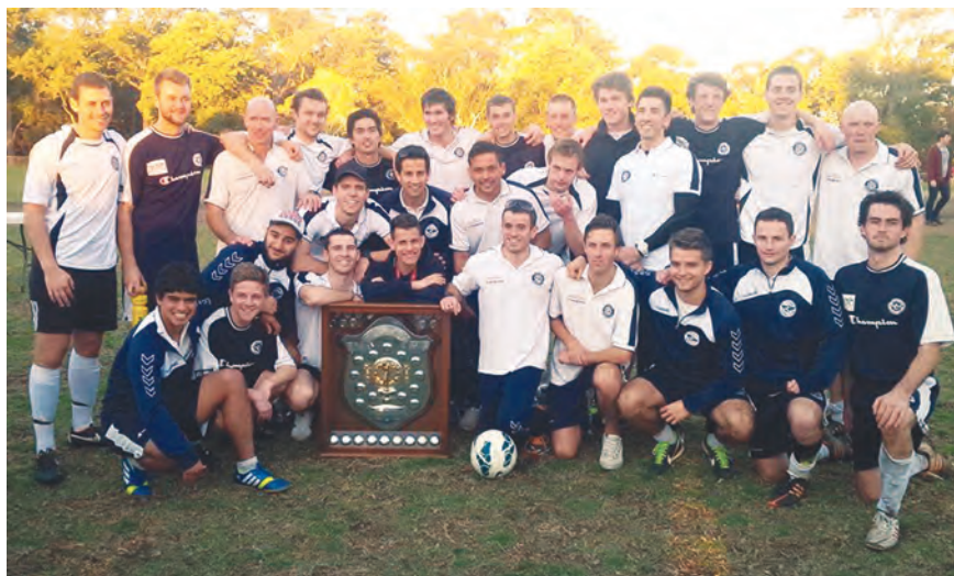
2013 AAM "Champion of Champions" – Lindfield.