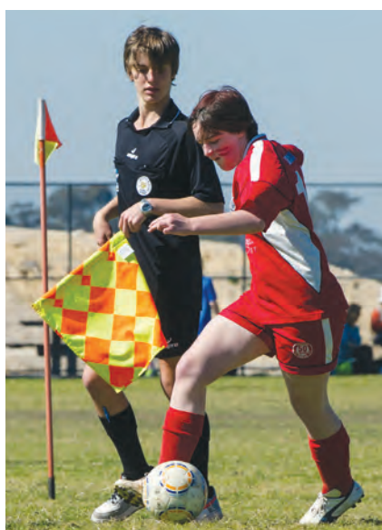
(below): KDFRA referees at club and 5-a-side match.