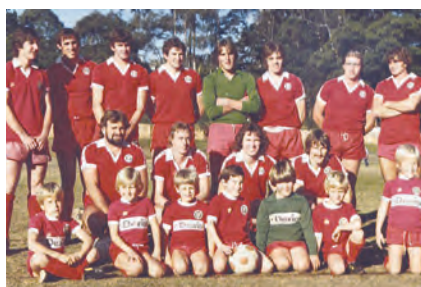
1980s Wahroonga Team.