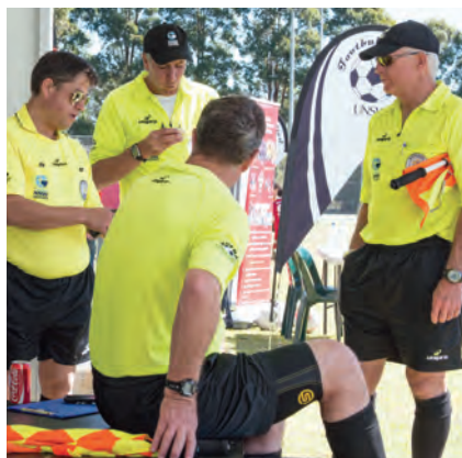
(above): Some of the referees who officiated at this years Gala Day at Montview Oval, Hornsby.