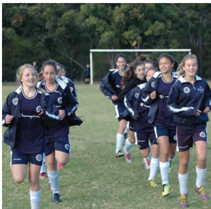
2013 "Champion of Champions" winner – Lindfield GU14s.