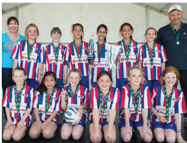
GU11 Group 1 Winners, Kissing Point S.