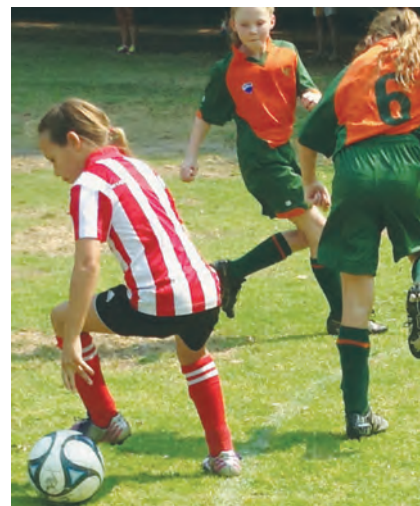
Diamond League trials held on Karuah Oval.

Chair — NSFA Girls' and Women's Committee