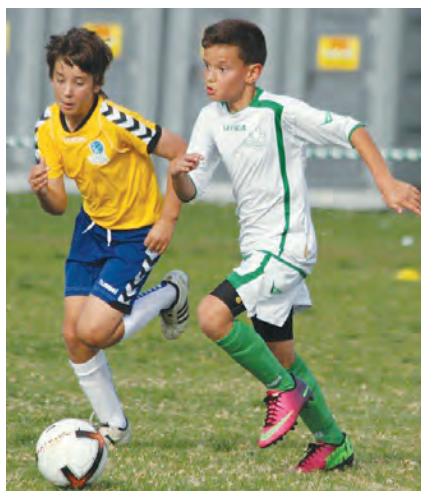
(above): An U11 NSFA SAP player in a race for the ball.