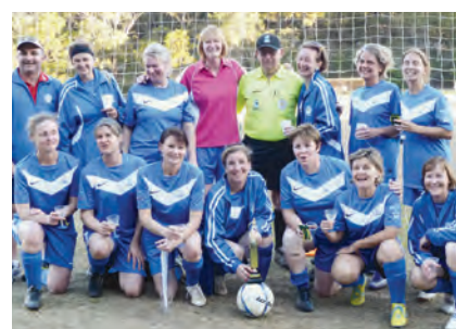
Women's Gala Day W35 Group 2 Winner: Chatswood Rangers.