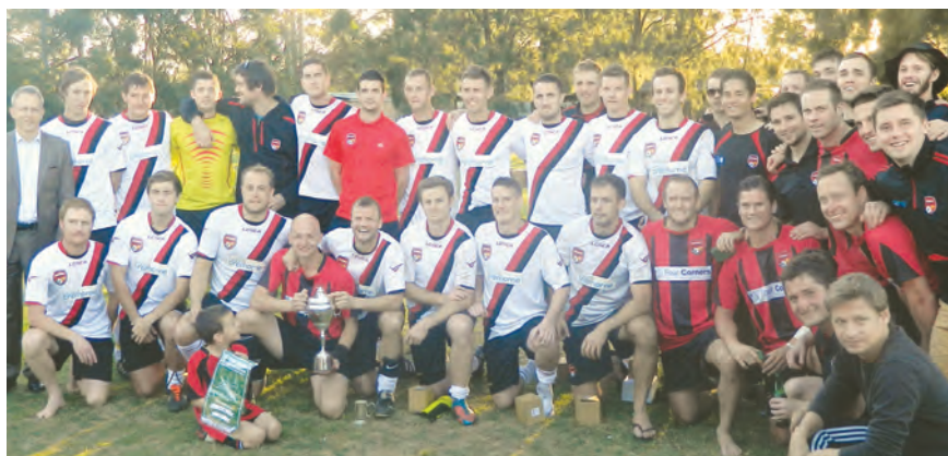
KDSA Cup 2013 winners – North Sydney United A with runners up North Sydney United B.