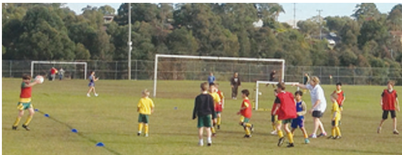
Mt Colah FC – skills training day – A-League Community All Stars day July 2013.