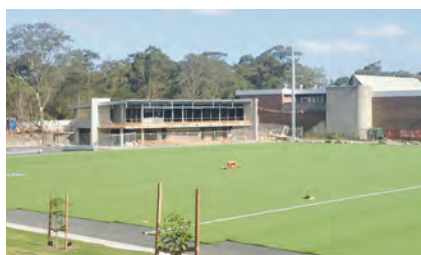
(above): The new upgrade of Eton Road (UTS).