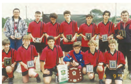
Winners Treasurer's Shield in 1993 North Sydney Artarmon.