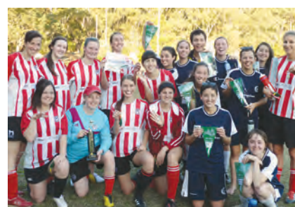
Women's Gala Day WAA Group 2 Winners: Northbridge; Runners Up: Lindfield.