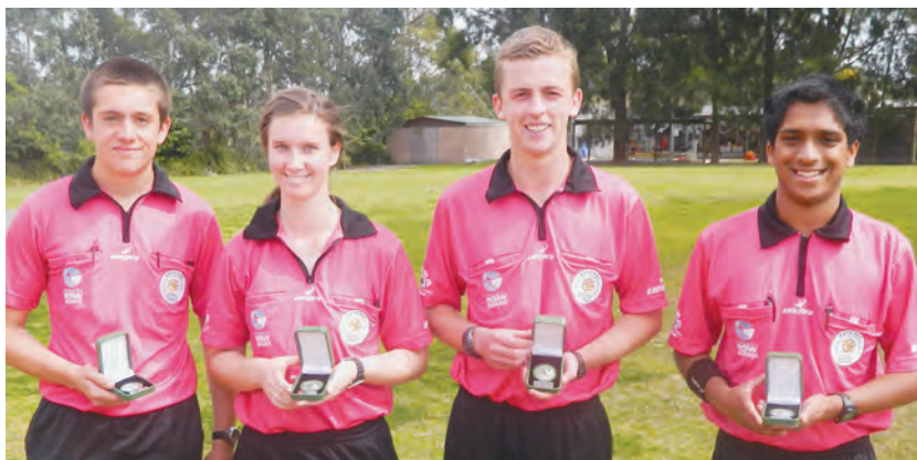
Vice President Shield 2013 match officials.

Another busy year for the PD & DC team this year.